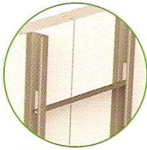
Spazzer® for lateral bracing